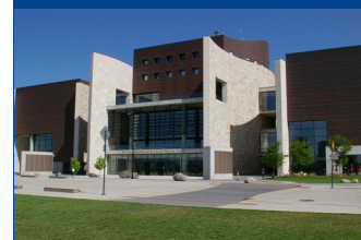
National Underground Railroad Freedom Center