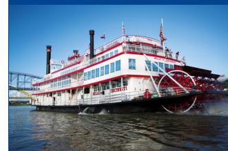
Enjoy a BB Riverboats Sightseeing Cruise

Departure: West Side Baptist Church, 2677 Dunn Road, Saint Louis, MO @ 8 am